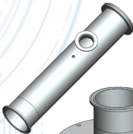
CDO Flange Assembly With Demisters pg. 4